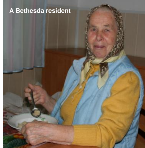
A Bethesda resident

Over the years a number of women in this center accepted Christ and went on to spend eternity with God.